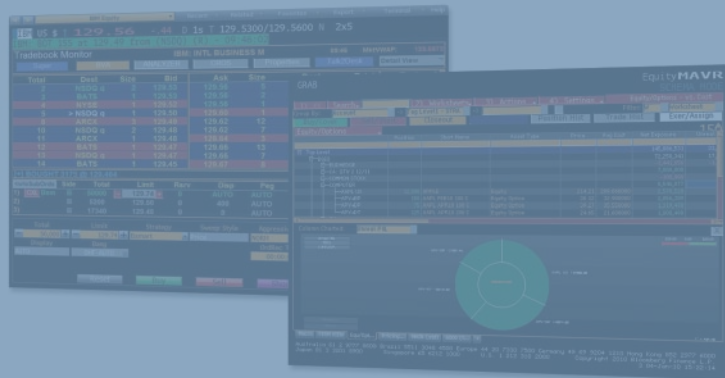
BLOOMBERG TRADEBOOK: Agency and trading platform

Working with VPM and Bloomberg ensures your investors that you are addressing their concerns by reducing investment and operational risk through increasing firm wide transparency.