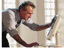
3a. View Online