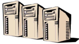
2. AvantGard Processing