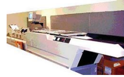
3b. Print, Fold, Insert