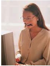
1. Upload File